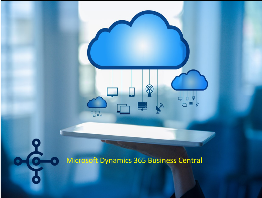
Microsoft Dynamics 365 Business Central

Microsoft Dynamics 365 Business Central Cloud Deployment- "In-The-Cloud" ERP simply means that business data and systems are stored elsewhere via internet connections.